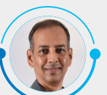
Mohanram Singapore National Eye Centre